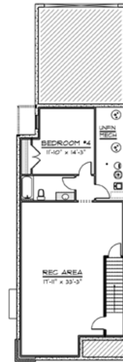
FINISHED BASEMENT LAYOUT 1,111 SF FINISHED