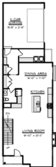
MAIN FLOOR PLAN 1,273 SF