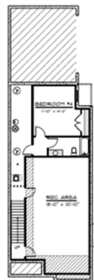
BASEMENT LAYOUT 1,071 SF FINISHED 202 SF UNFINISHED