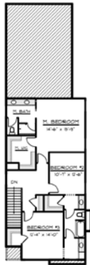
SECOND FLOOR PLAN 1,086 SF